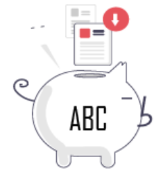
Transfer of Credits