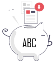
Transfer of Credits