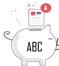
Transfer of Credits